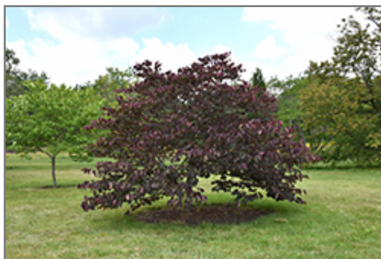
Forest Pansy Redbud