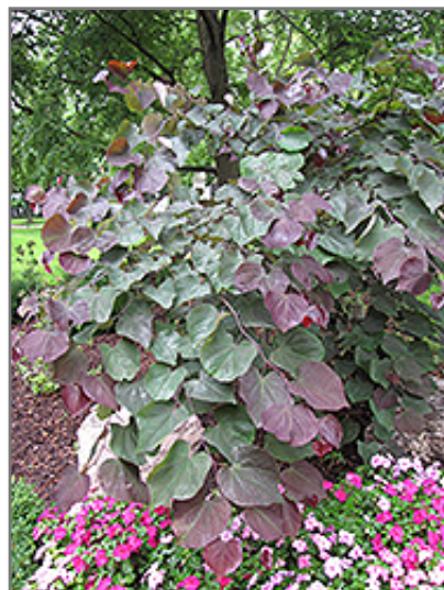
Forest Pansy Redbud foliage

This tree does best in full sun to partial shade. It prefers to grow in average to moist conditions, and shouldn't be allowed to dry out. It is not particular as to soil type or pH. It is highly tolerant of urban pollution and will even thrive in inner city environments, and will benefit from being planted in a relatively sheltered location. Consider applying a thick mulch around the root zone in winter to protect it in exposed locations or colder microclimates. This is a selection of a native North American species.