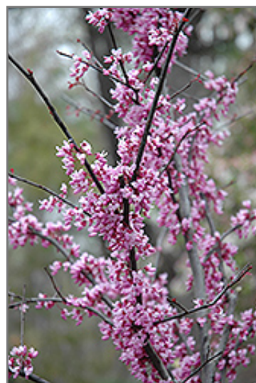
Forest Pansy Redbud flowers

This is a relatively low maintenance tree, and should only be pruned after flowering to avoid removing any of the current season's flowers. Deer don't particularly care for this plant and will usually leave it alone in favor of tastier treats. Gardeners should be aware of the following characteristic(s) that may warrant special consideration;