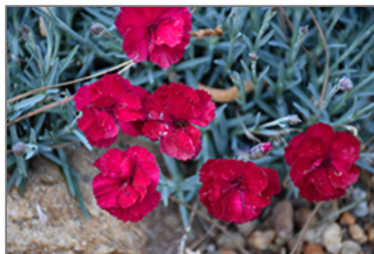
Frosty Fire Pinks flowers