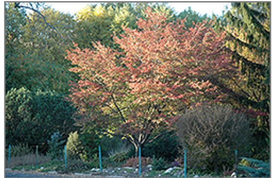
Robin Hill Serviceberry in fall

This tree does best in full sun to partial shade. It prefers to grow in average to moist conditions, and shouldn't be allowed to dry out. It is not particular as to soil type or pH. It is somewhat tolerant of urban pollution. This particular variety is an interspecific hybrid.