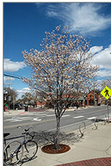
Robin Hill Serviceberry in bloom

This is a relatively low maintenance tree, and is best pruned in late winter once the threat of extreme cold has passed. It is a good choice for attracting birds to your yard, but is not particularly attractive to deer who tend to leave it alone in favor of tastier treats. It has no significant negative characteristics.