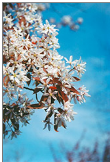
Robin Hill Serviceberry flowers