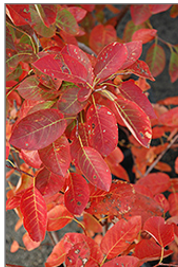
Autumn Brilliance Serviceberry in fall