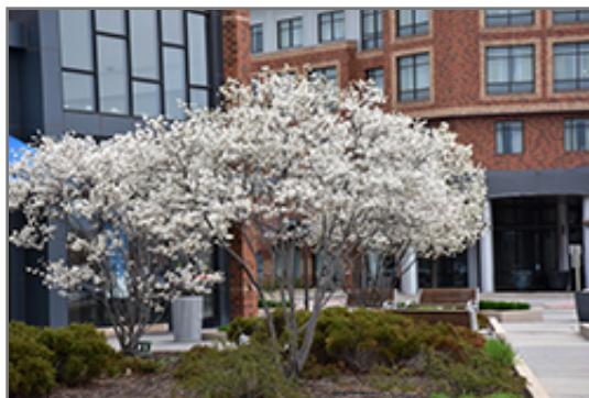
Autumn Brilliance Serviceberry in bloom

This is a relatively low maintenance tree, and is best pruned in late winter once the threat of extreme cold has passed. It is a good choice for attracting birds to your yard, but is not particularly attractive to deer who tend to leave it alone in favor of tastier treats. It has no significant negative characteristics.