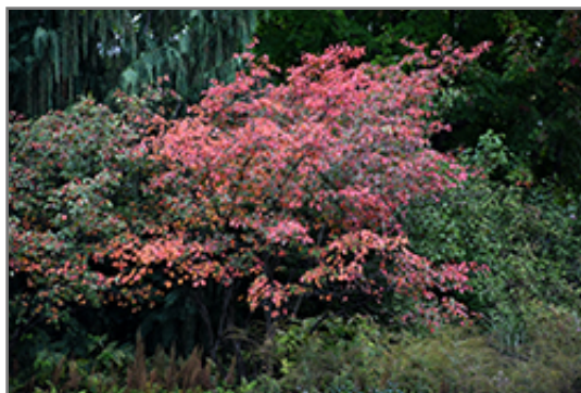
Autumn Brilliance Serviceberry in fall

This tree does best in full sun to partial shade. It prefers to grow in average to moist conditions, and shouldn't be allowed to dry out. It is not particular as to soil type or pH. It is somewhat tolerant of urban pollution. This particular variety is an interspecific hybrid.