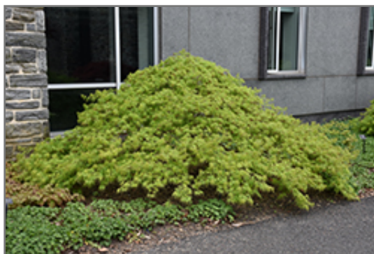
Waterfall Japanese Maple