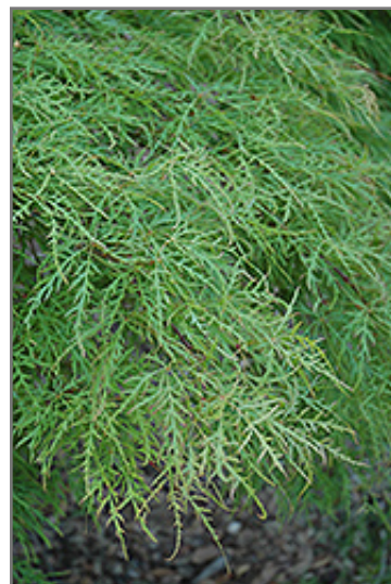
Waterfall Japanese Maple foliage

Waterfall Japanese Maple is recommended for the following landscape applications;