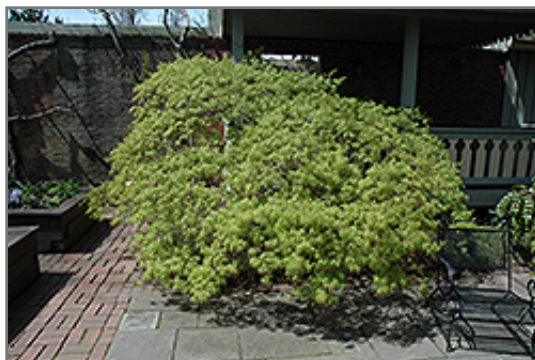
Waterfall Japanese Maple

Waterfall Japanese Maple will grow to be about 10 feet tall at maturity, with a spread of 12 feet. It tends to be a little leggy, with a typical clearance of 2 feet from the ground, and is suitable for planting under power lines. It grows at a slow rate, and under ideal conditions can be expected to live for 80 years or more.