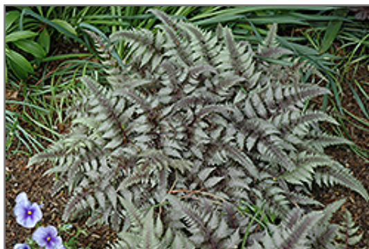
Burgundy Lace Painted Fern

This is a relatively low maintenance plant, and usually looks its best without pruning, although it will tolerate pruning. Deer don't particularly care for this plant and will usually leave it alone in favor of tastier treats. It has no significant negative characteristics.