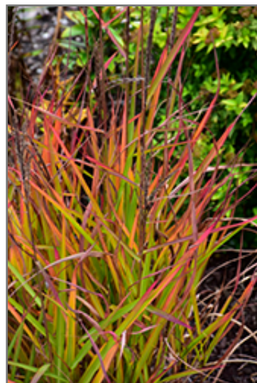
Flame Grass in fall

This plant does best in full sun to partial shade. It prefers to grow in average to moist conditions, and shouldn't be allowed to dry out. It is not particular as to soil type or pH. It is highly tolerant of urban pollution and will even thrive in inner city environments. This is a selected variety of a species not originally from North America. It can be propagated by division; however, as a cultivated variety, be aware that it may be subject to certain restrictions or prohibitions on propagation.