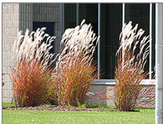
Flame Grass in bloom

Flame Grass is recommended for the following landscape applications;