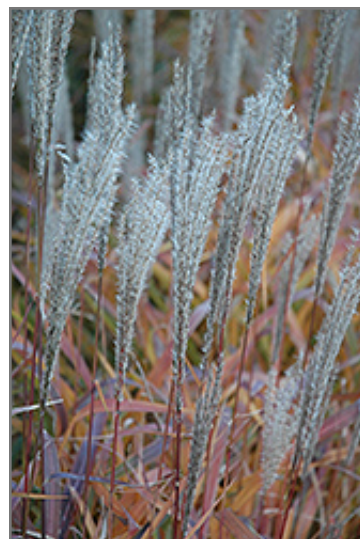
Flame Grass fruit