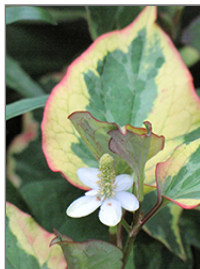
Chameleon Houttuynia flowers