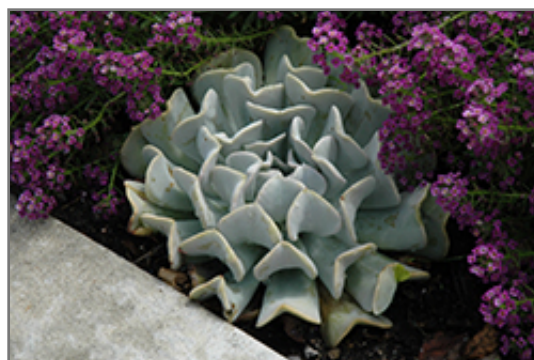
Topsy Turvy Echeveria

Topsy Turvy Echeveria is a dense herbaceous evergreen perennial with tall flower stalks held atop a low mound of foliage. Its relatively fine texture sets it apart from other garden plants with less refined foliage.