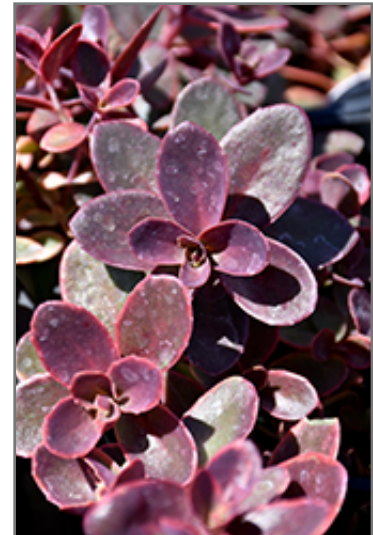
Wildfire Stonecrop foliage

Wildfire Stonecrop is a dense herbaceous perennial with a ground-hugging habit of growth. Its relatively fine texture sets it apart from other garden plants with less refined foliage.