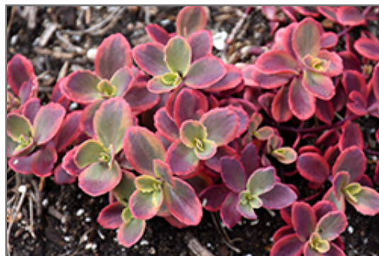
Sunsparkler Wildfire Stonecrop foliage