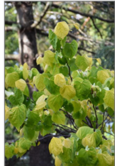
Solar Eclipse Redbud foliage

This tree does best in full sun to partial shade. It prefers to grow in average to moist conditions, and shouldn't be allowed to dry out. It is not particular as to soil type or pH. It is highly tolerant of urban pollution and will even thrive in inner city environments, and will benefit from being planted in a relatively sheltered location. Consider applying a thick mulch around the root zone in winter to protect it in exposed locations or colder microclimates. This is a selection of a native North American species.