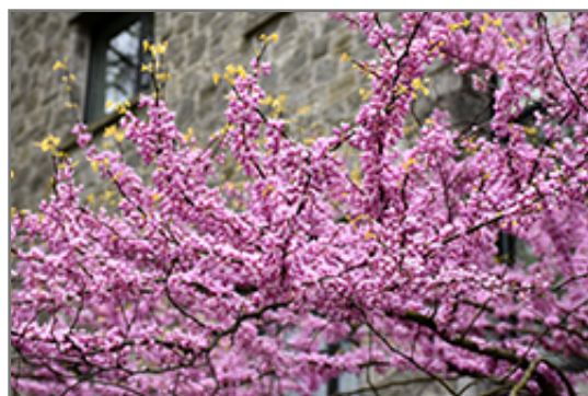
Solar Eclipse Redbud flowers

Solar Eclipse Redbud is a deciduous tree with an upright spreading habit of growth. Its relatively coarse texture can be used to stand it apart from other landscape plants with finer foliage.