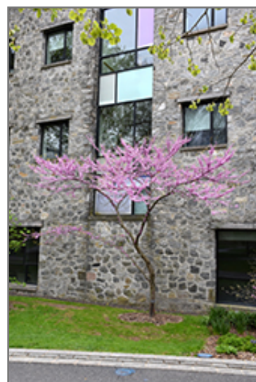
Solar Eclipse Redbud in bloom