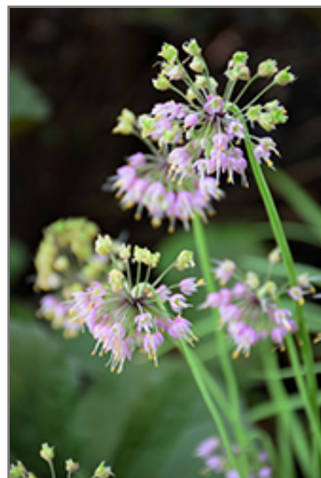
Nodding Onion flowers

This plant should only be grown in full sunlight. It does best in average to evenly moist conditions, but will not tolerate standing water. It is not particular as to soil type or pH, and is able to handle environmental salt. It is highly tolerant of urban pollution and will even thrive in inner city environments. This species is native to parts of North America. It can be propagated by multiplication of the underground bulbs.