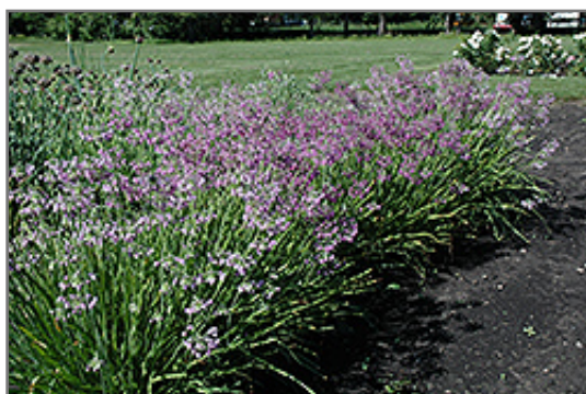
Nodding Onion in bloom