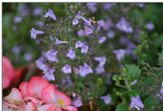
Marvelette Blue Dwarf Calamint flowers