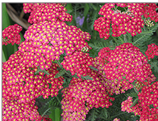
Galaxy Paprika Yarrow flowers