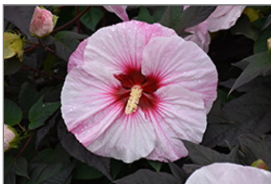
Summerific Perfect Storm Hibiscus flowers