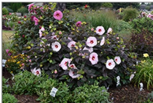
Summerific Perfect Storm Hibiscus in bloom