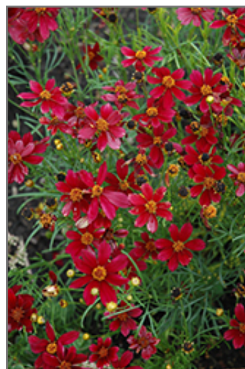
Red Satin Tickseed flowers

Red Satin Tickseed is recommended for the following landscape applications;