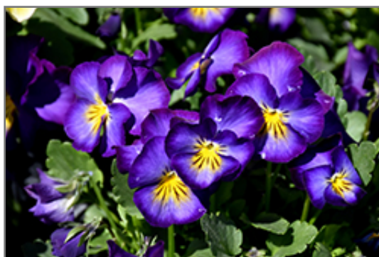
Halo Violet Pansy flowers

Halo Violet Pansy is an herbaceous perennial with a mounded form. Its relatively fine texture sets it apart from other garden plants with less refined foliage.