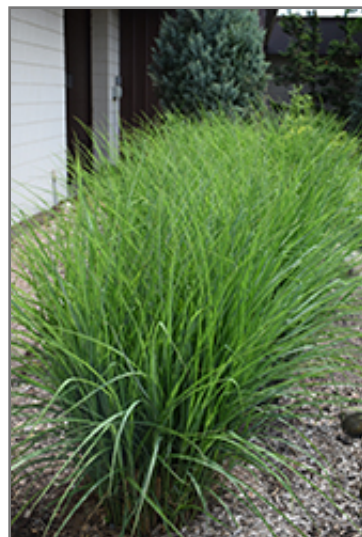
Oktoberfest Maiden Grass