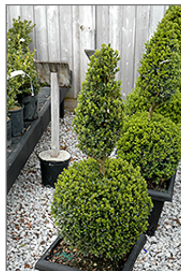
Green Mountain Boxwood (poodle form)

Green Mountain Boxwood (poodle form) will grow to be about 3 feet tall at maturity, with a spread of 18 inches. It tends to be a little leggy, with a typical clearance of 1 foot from the ground. It grows at a slow rate, and under ideal conditions can be expected to live for approximately 30 years.