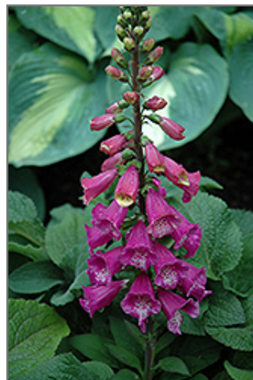
Candy Mountain Foxglove flowers

Candy Mountain Foxglove is recommended for the following landscape applications;