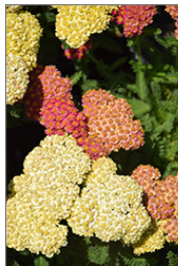
Desert Eve Terracotta Yarrow flowers