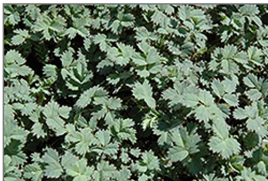
Blue Haze New Zealand Burr foliage