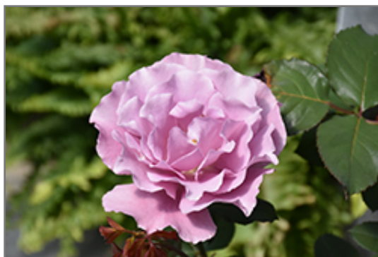
Angel Face Rose flowers