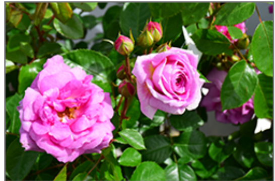
Angel Face Rose flowers

This shrub does best in full sun to partial shade. It does best in average to evenly moist conditions, but will not tolerate standing water. It is not particular as to soil type or pH. It is highly tolerant of urban pollution and will even thrive in inner city environments. This particular variety is an interspecific hybrid.