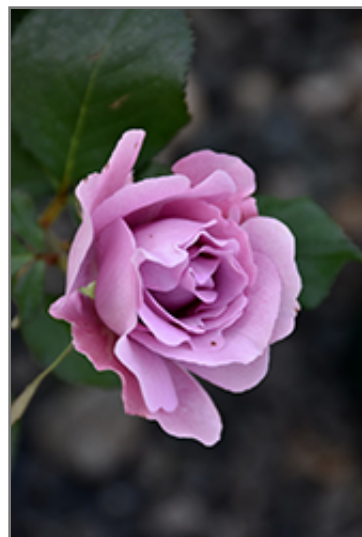
Angel Face Rose flowers

This shrub will require occasional maintenance and upkeep, and is best pruned in late winter once the threat of extreme cold has passed. It is a good choice for attracting bees to your yard. Gardeners should be aware of the following characteristic(s) that may warrant special consideration;