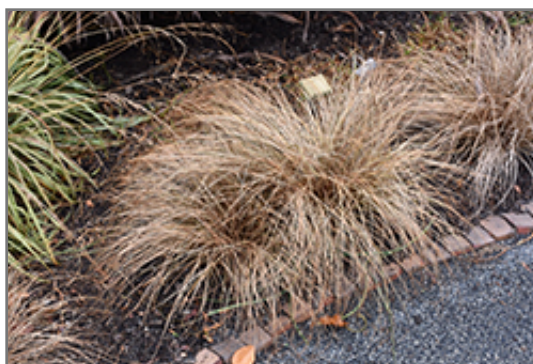
Bronze Hair Sedge